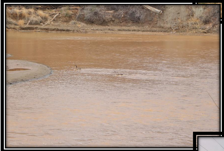
Geese on the River