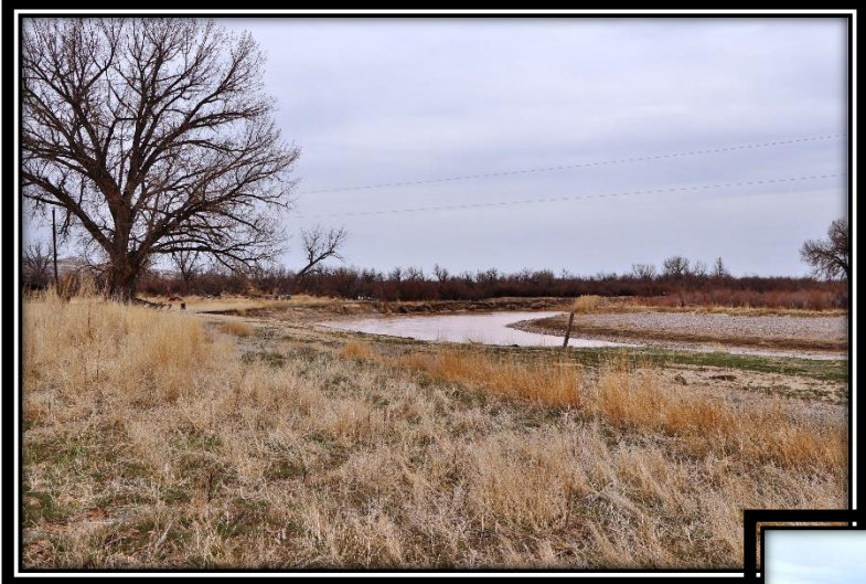
Big Horn River