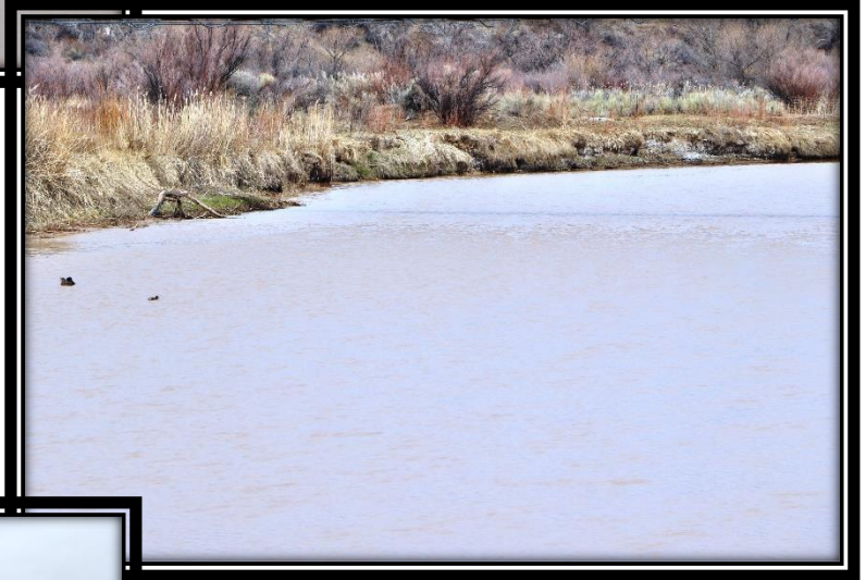
Pelicans on the River