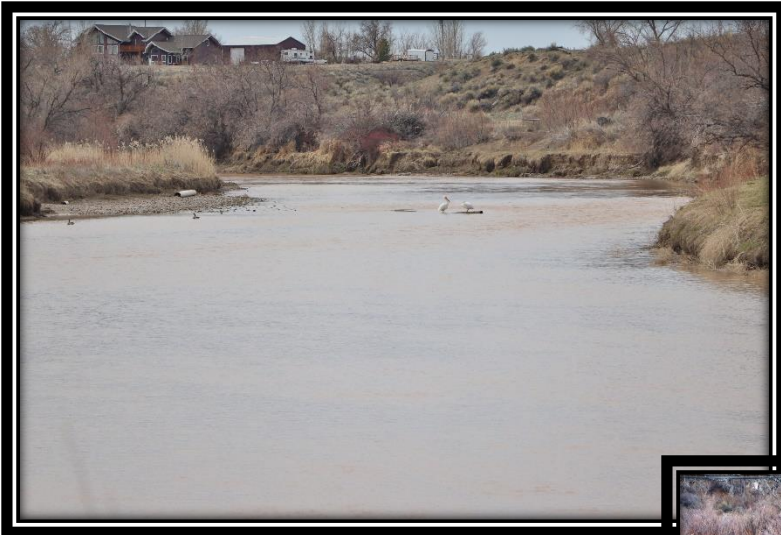
Big Horn River