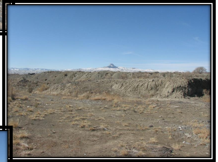
View of Heart Mountain