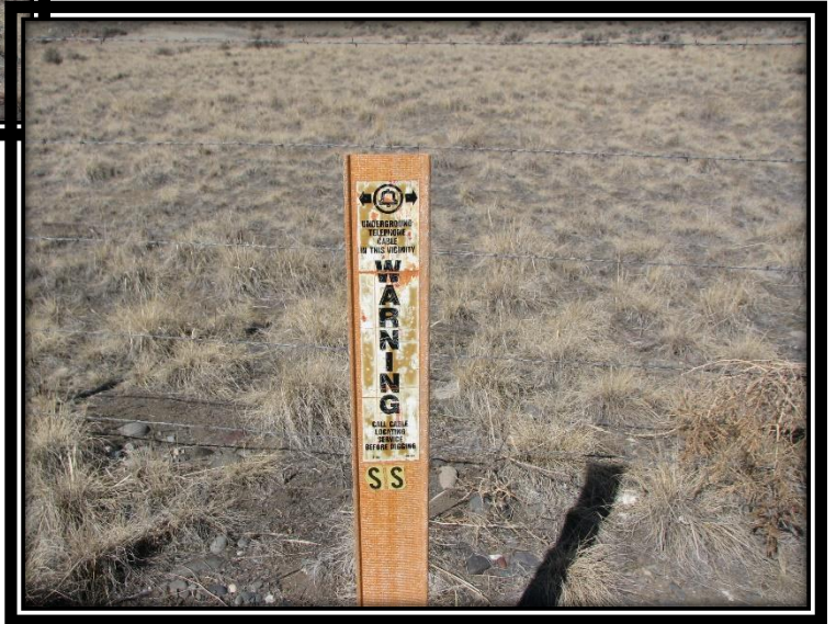
Underground Cable In the Vicinity