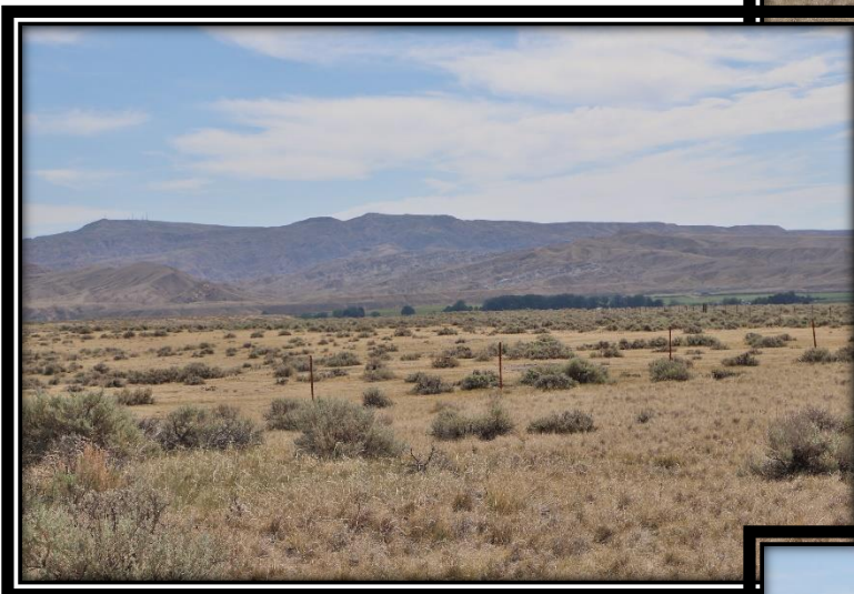
Views of the McCullough Peaks