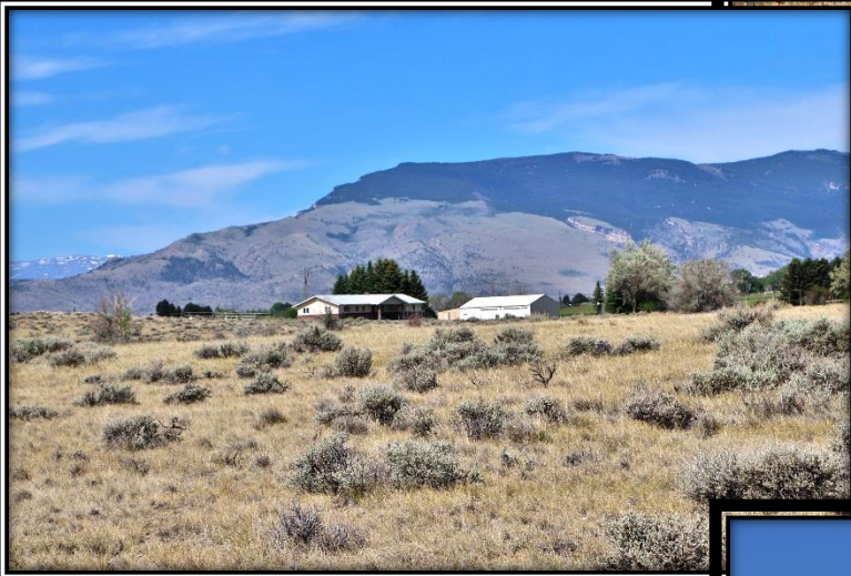
View of Rattlesnake Mountain