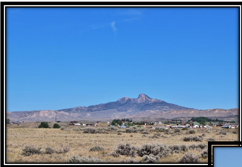
View of Heart Mountain