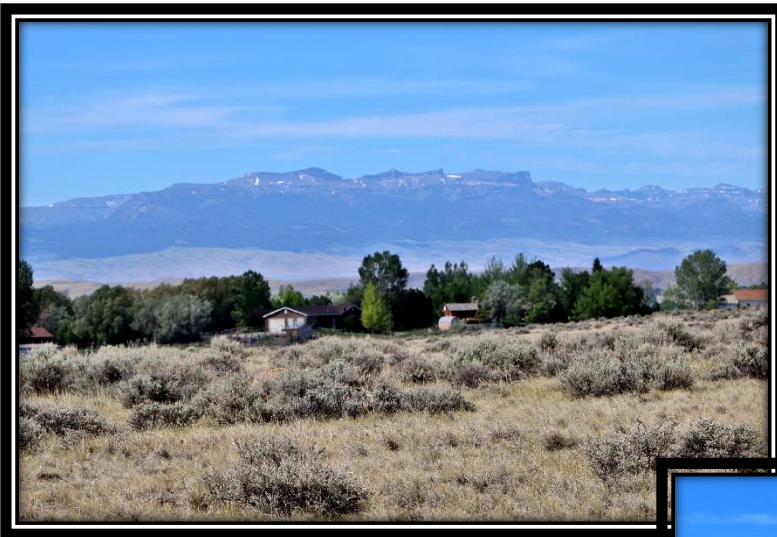
Views of the Beartooth Mountains