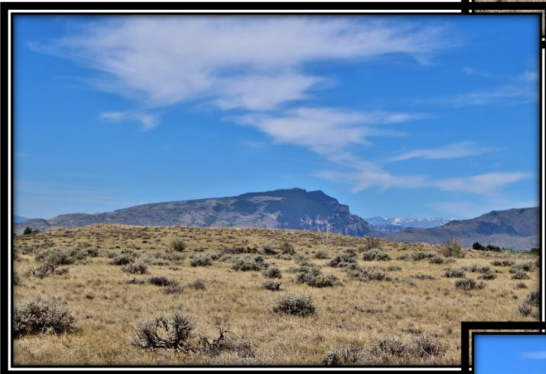
View of Cedar Mountain