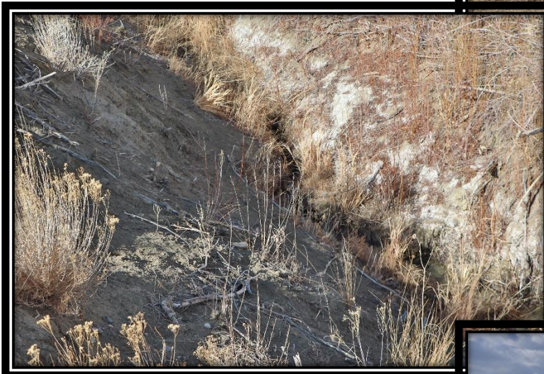
Slough- live water