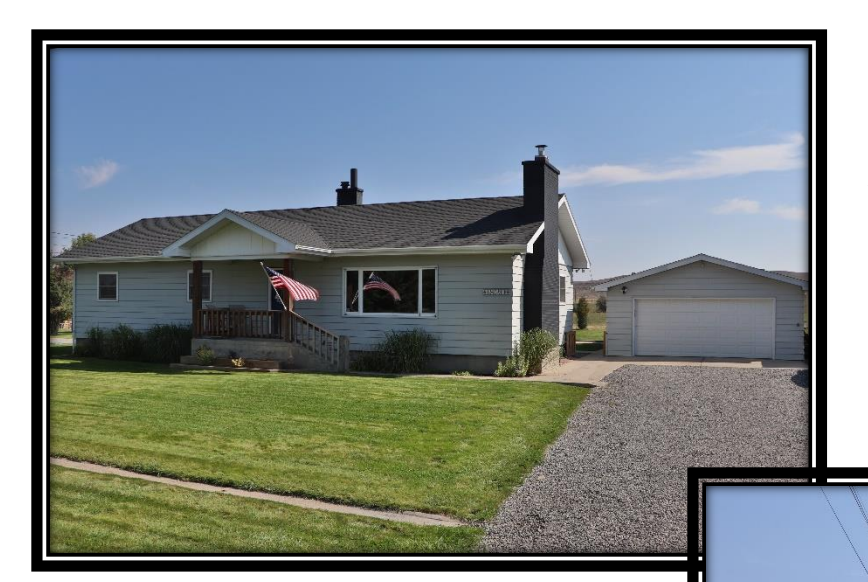
Home & Detached Garage