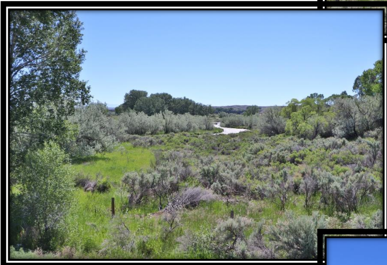
Excellent Wildlife Habitat