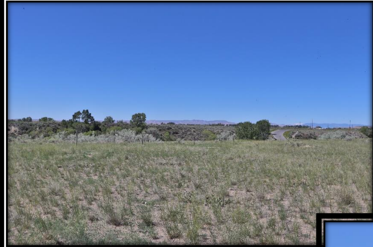
Possible Building Site