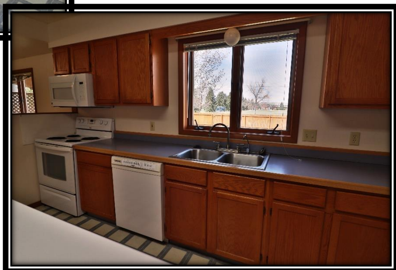
View of Park Through Kitchen Window