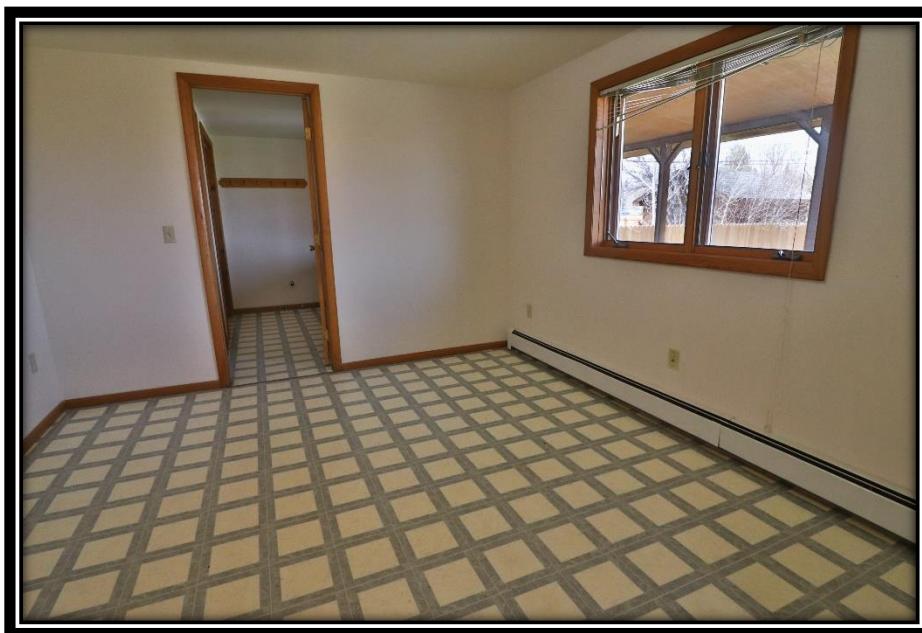
Door Leads Into Laundry Room