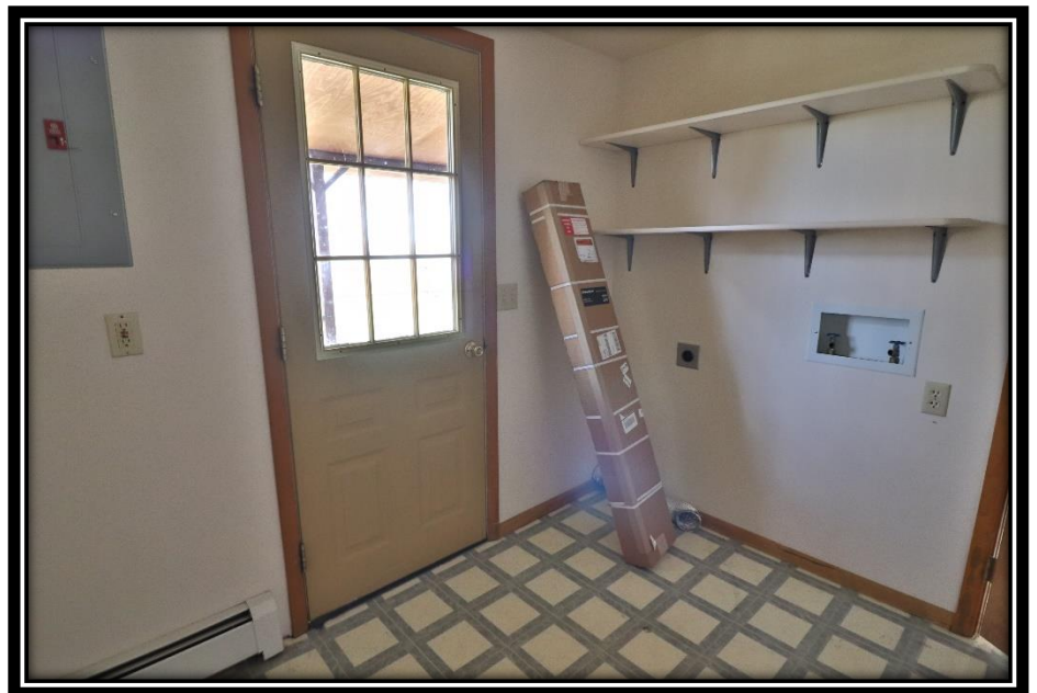
Door To Garage