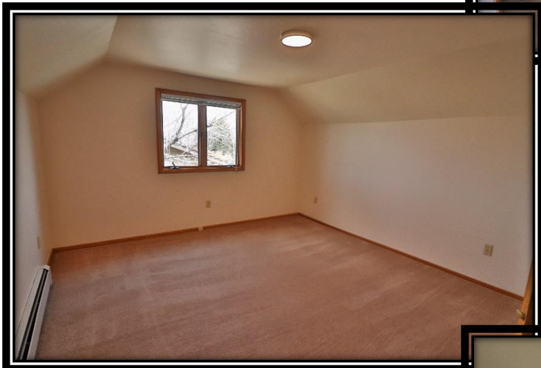
Bedroom Two On Second Level