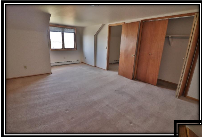
Bedroom One On Second Level