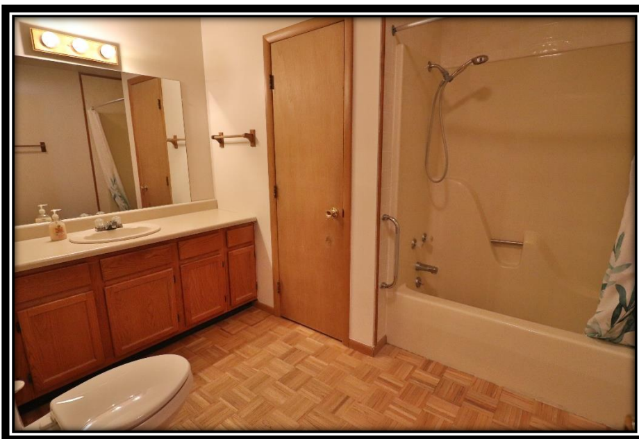
Full Bath Main Level