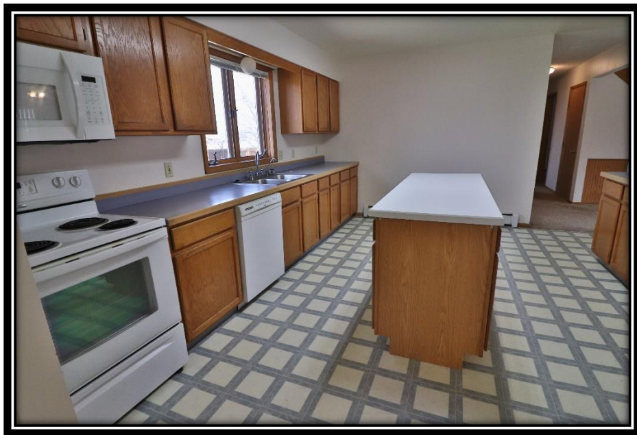
Island in Kitchen