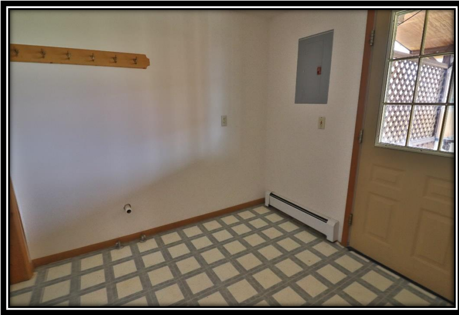
Laundry Room Door to Back Yard