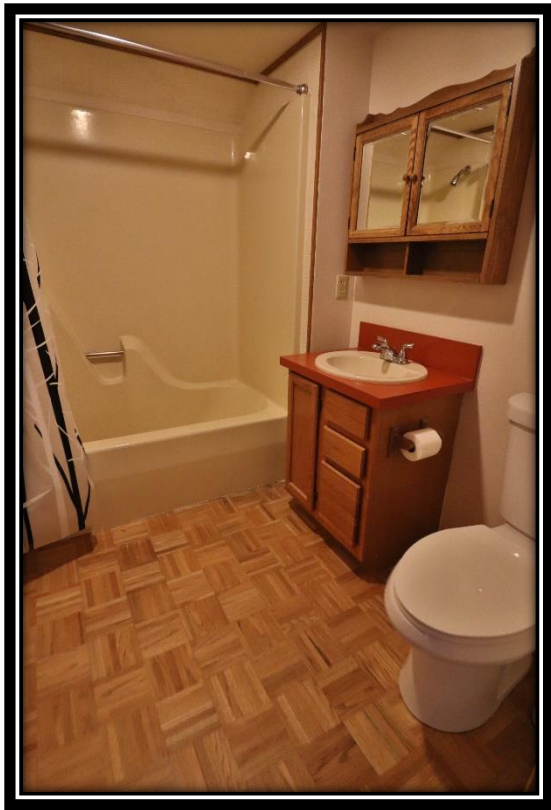
Full Bath On Second Level