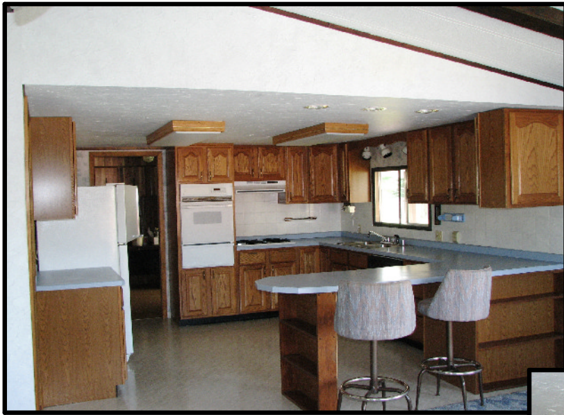
KITCHEN OAK CABINETS