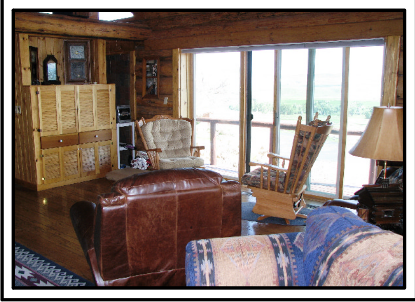
SITTING AREA WITH BUILT-IN ENT. CENTER