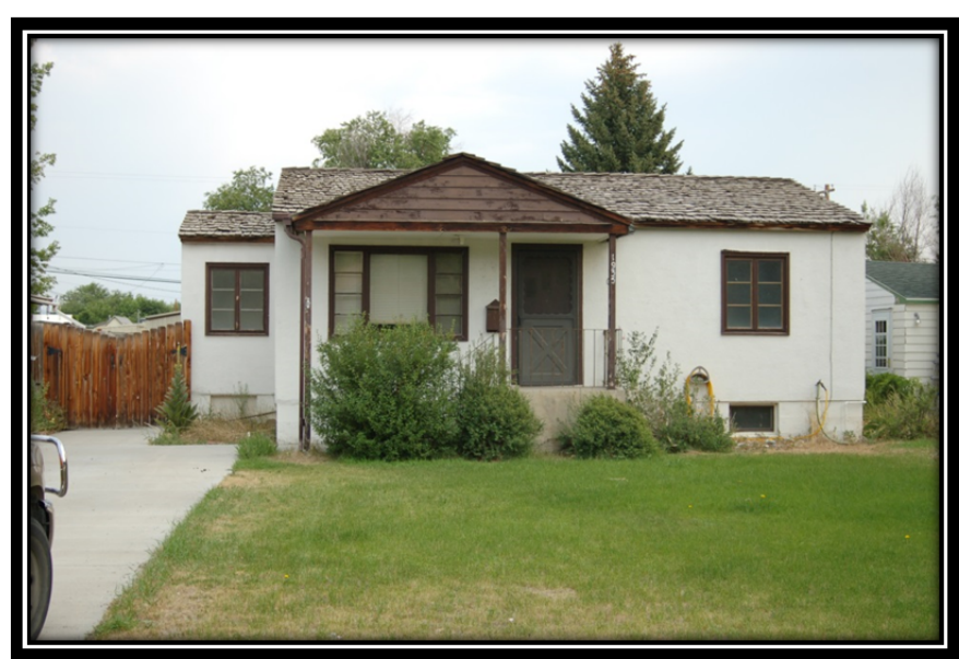
Cute House with Large Back Yard