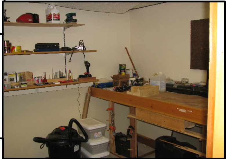
Horse Shelter Corral