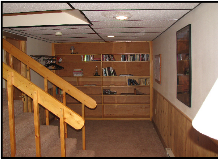
Built In Bookcases Lower Level