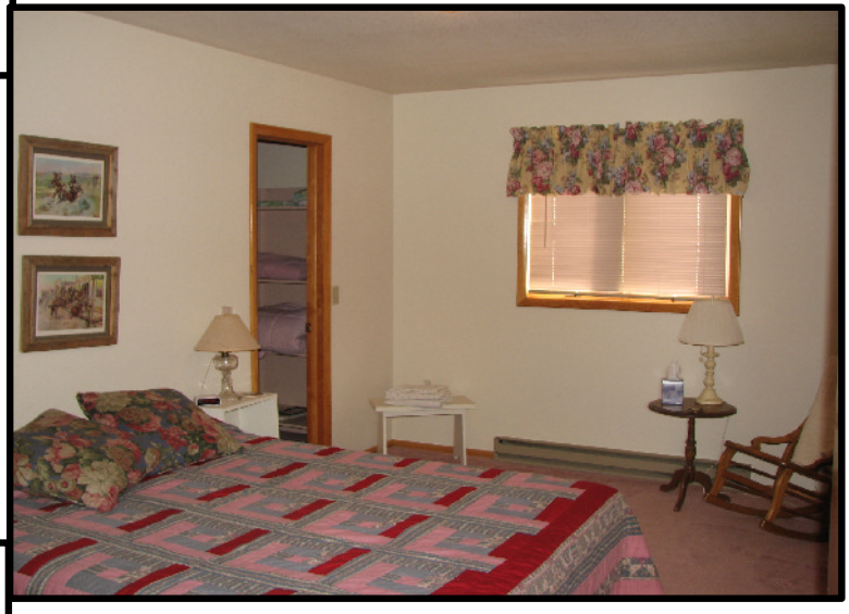
Family Room Lower Level