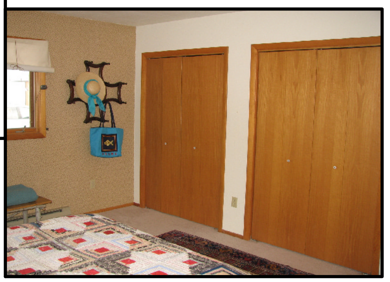
Double Closets Master