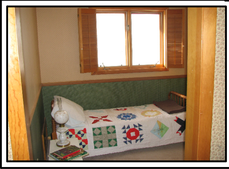
Sitting Area Master