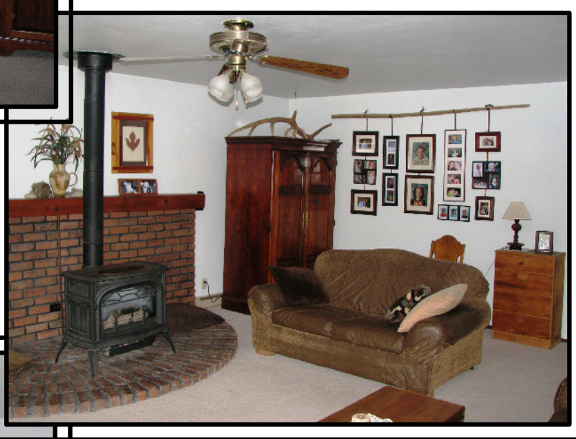
COZY GAS STOVE